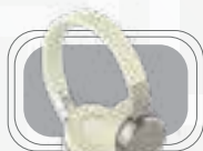
Lenovo Yoga Active Noise-cancellation Headphones