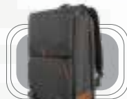
Lenovo 15.6" Laptop Urban Backpack B810

* Example of Lenovo Yoga catalogue naming convention