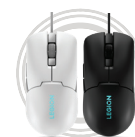
Lenovo Legion M300s RGB Gaming Mouse