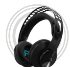
Lenovo Legion H300 Stereo Gaming Headset