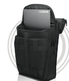
Lenovo Legion Active Gaming Backpack

* Example of Lenovo catalogue naming convention