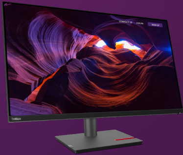
ThinkVision P32p-30 Display