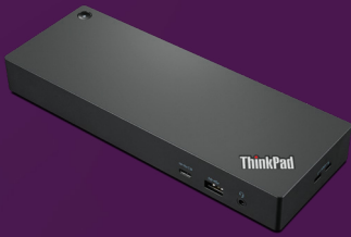
ThinkPad Workstation Thunderbolt™ 4 Dock