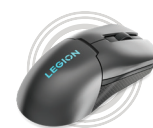
Legion M600s Qi Wireless Gaming Mouse