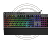
Legion K300 Mechanical Keyboard