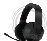
Legion H600 Wireless Headset + S600 Headset H600 Wireless Headset Stand