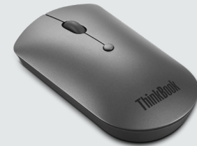
ThinkBook Bluetooth Silent Mouse PN: 4Y50X88824

The Lenovo Go Wireless ANC Headset with Teams Certification is designed to reduce ambient noise and maintain productivity while on the go. The USB-A Bluetooth receiver provides an outstanding connection. With Microsoft Teams Certification and cutting-edge noise cancellation technology, both office and remote workers will have the tools they need to tune out distractions and tune in to their work - all in one headset. This supports dual Bluetooth 5.0 and USB Audio connectivity for multitasking and advanced noise cancellation with ANC & ENC optimizes audio quality and talk-through. It features 1.5 hours of fast charging and up to 35 hours of playback time.