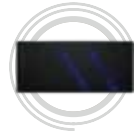
Legion Gaming Control Mouse Pad XXL

* Example of Lenovo marketing catalogue naming convention