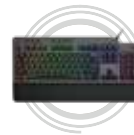
Legion K500 RGB Mechanical keyboard