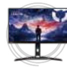
Legion Y27qf-30 Monitor