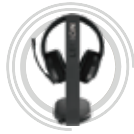
Legion S600 Gaming Station