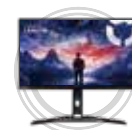
Legion Y27qf-30 Monitor