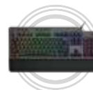
Legion K500 RGB Mechanical keyboard