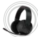
Legion H600 Wireless Gaming Headset