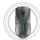
Legion M600s Qi Wireless Gaming Mouse