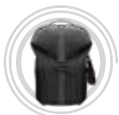
Legion 16" Functional Gaming Backpack GB700