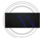
Legion Gaming Control Mouse Pad XXL

* Example of Lenovo catalogue naming convention