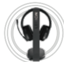
Legion S600 Gaming Station