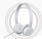
Lenovo 110 USB Stereo Headset