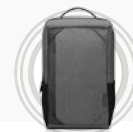
Lenovo 15.6" Laptop Urban Backpack B530