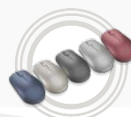
Lenovo 530 Wireless Mouse