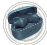
Lenovo TWS YOGA PC Edition