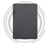
Lenovo YOGA 14-inch Sleeve