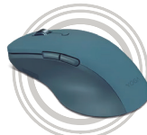
Yoga Pro Mouse