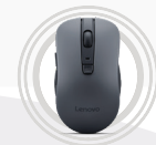
Lenovo WL310 Bluetooth® Silent Mouse