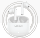
Lenovo E310 True Wireless Stereo Earbuds