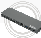
Lenovo USB-C Mini Dock