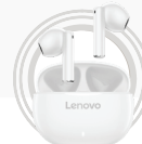
Lenovo E310 True Wireless Stereo Earbuds