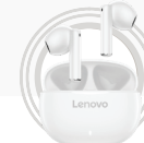
Lenovo E310 True Wireless Stereo Earbuds