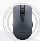
Lenovo WL310 Bluetooth ® Silent Mouse