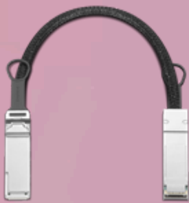
ThinkStation PGX QSFP Link Cable 4X91U42988

Lenovo may not offer the products, services or features discussed in this document in all regions. Lenovo may withdraw an offering at any time. Information is subject to change without notice. Consult your local representative for information on offerings available in your area. Lenovo reserves the right to change specifications or other product information without notice. Lenovo is not responsible for photographic or typographical errors. Lenovo provides this publication "as is" without warranty of any kind, either express or implied, including the implied warranties of merchantability or fitness for a particular purpose.