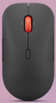
Lenovo Wireless Multi-Mode Pro Plus Mouse 6050 (Eclipse Black) 4Y51S61876