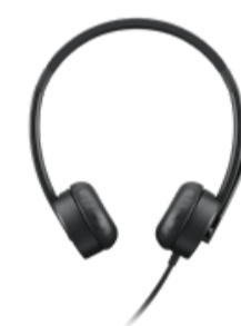
Lenovo Essential Stereo Analog Headset