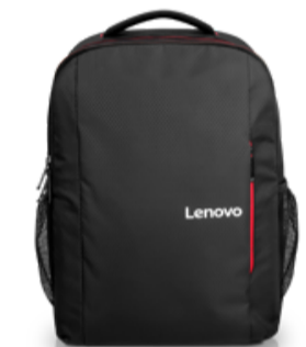
Lenovo 16" Laptop Everyday Backpack B510