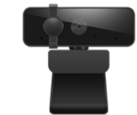
Lenovo 310 FHD Webcam Black