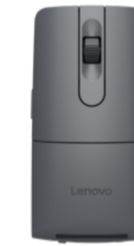
ThinkPad Bluetooth Presenter Mouse (Aura Edition)