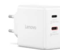
Lenovo Dual USB-C 65W GaN Charger