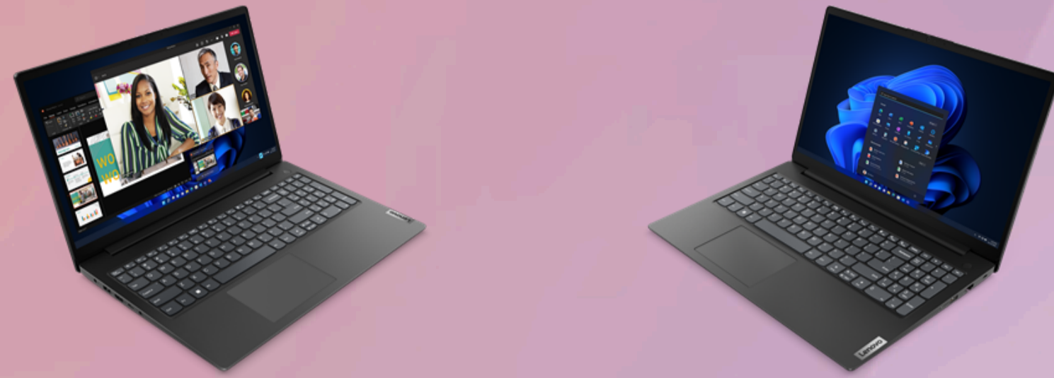
The product images are for illustration purposes only. Actual product appearance, ports, keyboard layout, and accessories may vary by model.