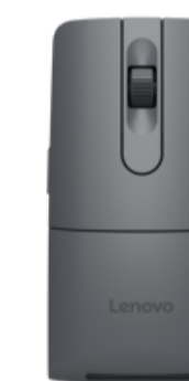
ThinkPad Bluetooth Presenter Mouse (Aura Edition) 4Y51T62792