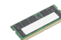
ThinkStation 48GB DDR5 6400MT/s ECC CSODIMM Memory