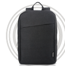
Lenovo 15.6" Laptop Backpack B210