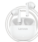
Lenovo E310 True Wireless Stereo Earbuds