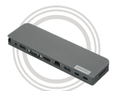
Lenovo USB-C Mini Dock