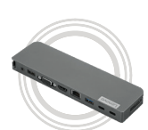
Lenovo USB-C Mini Dock