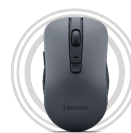
Lenovo WL310 Bluetooth® Silent Mouse