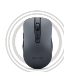
Lenovo WL310 Bluetooth® Silent Mouse