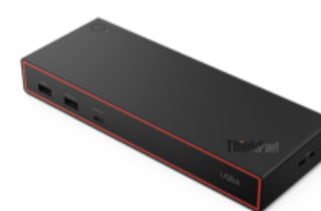
ThinkPad USB4 Dock 5000 (with 135W Adapter)