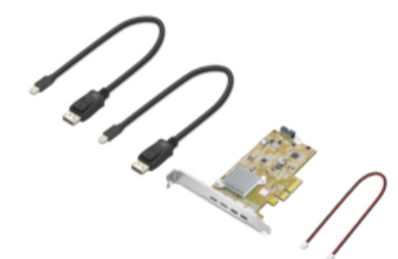
ThinkStation USB4 Dual Port PCIe Card