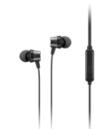
Lenovo Analog In-Ear Headphones Gen II Bulk Package (20pcs)