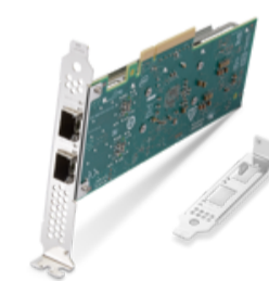
Intel E810-DA2 10/25GbE SFP28 2-Port PCIe Ethernet Adapter