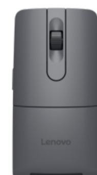
ThinkPad Bluetooth Presenter Mouse (Aura Edition)