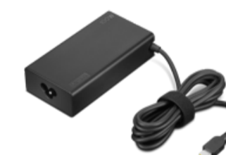
Lenovo USB-C 100W AC Adapter-EU