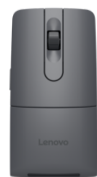
ThinkPad Bluetooth Presenter Mouse (Aura Edition)