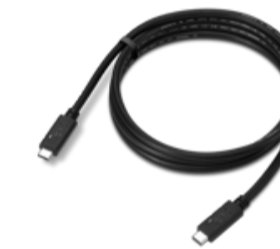
Lenovo USB 20Gbps USB-C to USB-C Cable 1.5m