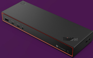
ThinkPad Thunderbolt 5 Smart Dock 7500