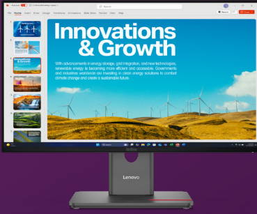
ThinkVision P24QD-40 Display