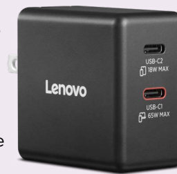
PN: US: 40AW065BUS (Black) 40AW065WUS (White) EU: 40AW065BEU (Black) 40AW065WEU (White) UK: 40AW065BUK (Black) 40AW065WUK (White)

Effortlessly charge your laptop and an additional mobile device at the same time. Lightweight, compact and engineered to meet Lenovo standards, this charger delivers fast, safe and reliable charging across multiple laptop series, ensuring your devices stay powered and protected wherever you go.