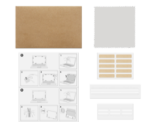
Lenovo 13.3" Clarity Privacy Filter 4XJ1U03945