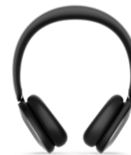
ThinkPad Dual-Mode Wireless ANC Foldable Headset 8550 (Aura Edition) - USB-C, Teams 4XD1T60925