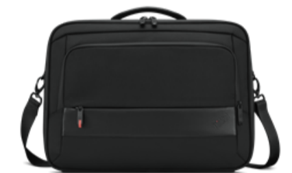
ThinkPad Professional 16-inch Topload Gen 2 4X41M69795