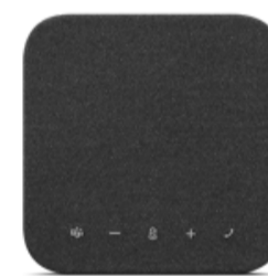
Lenovo Wireless Speakerphone 6000