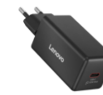
Lenovo 65W Mini USB-C GaN Charger