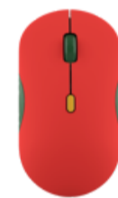
Lenovo 350 Bluetooth Silent Mouse (Fan Edition - Portugal)