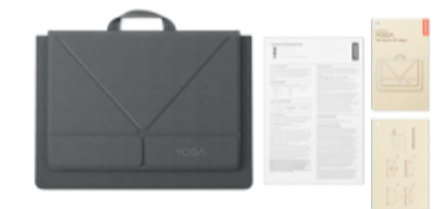
Lenovo Yoga Tote Sleeve (14" Grey)