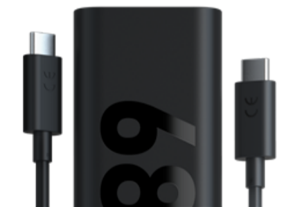
Lenovo 68W USB-C Wall Charger