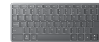
Lenovo Multi-Device Wireless Keyboard